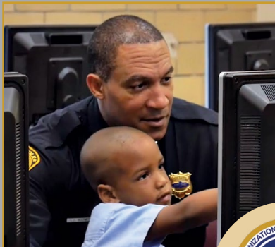
Norfolk Police Department