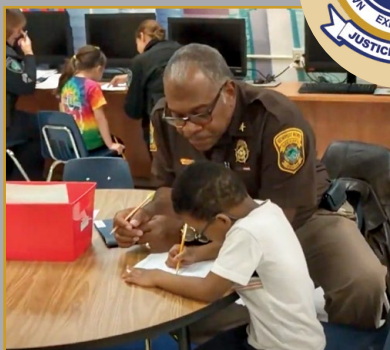
Newport News Sheriff's Office