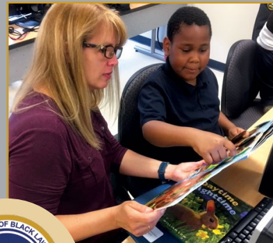
Norfolk Sheriff's Office