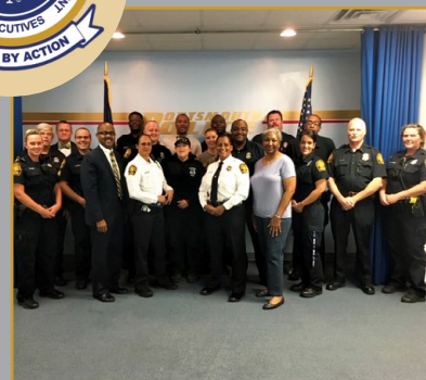
Portsmouth Police Departmet